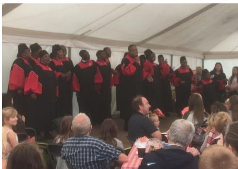
DMU Gospel Choir

During the evening the sun came out to greet Robbie Williams and Queen who put on a superb show for those with the energy left after the day's festivities.